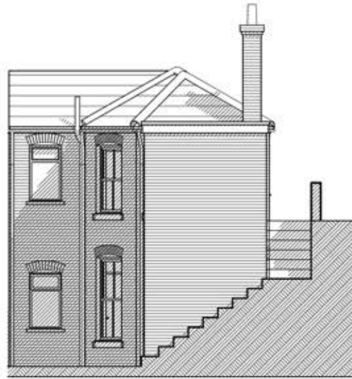
South elevation existing