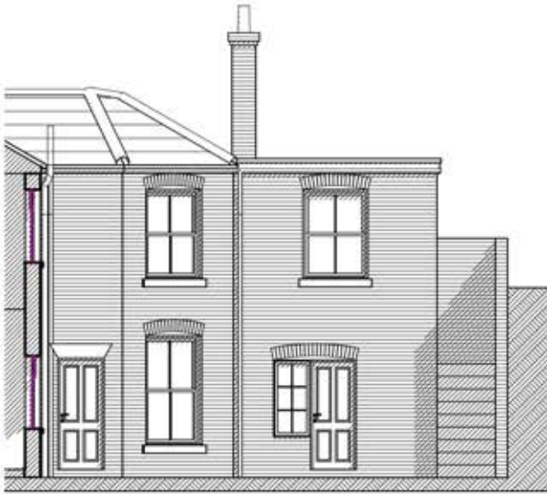
West elevation existing