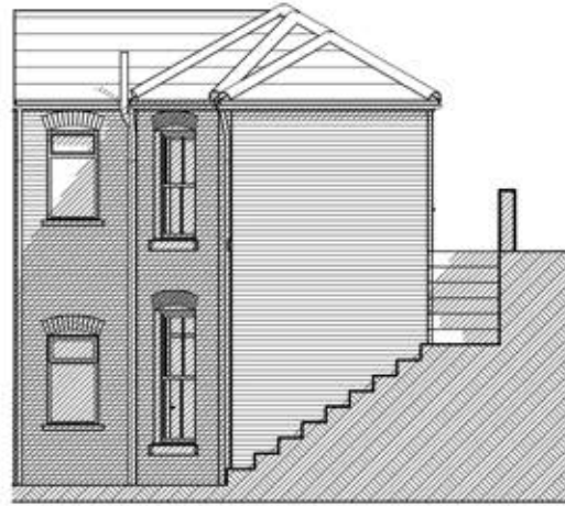
South elevation proposed