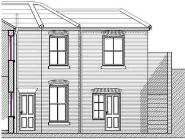
West elevation proposed