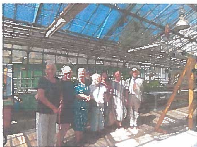
At the Hydroponic experimental unit in the University of Novi Sad

The school is working with the Biology Department of the University in developing an Hydroponic (soil less) system of fruit production (strawberries). This provides an environment that is structured and 'safe' for Autistic young people and also those with other disabilities – particularly those in wheelchairs. This provides experience and training for youngsters to be gardeners/florists etc. It also provides an opportunity for other students from the University (It is thought from the Psychology Department) to work alongside the beneficiaries and to study disabilities and human development.