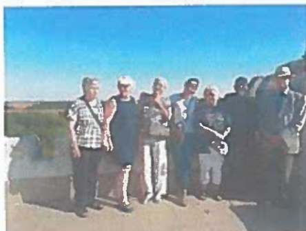
On top of the world.....