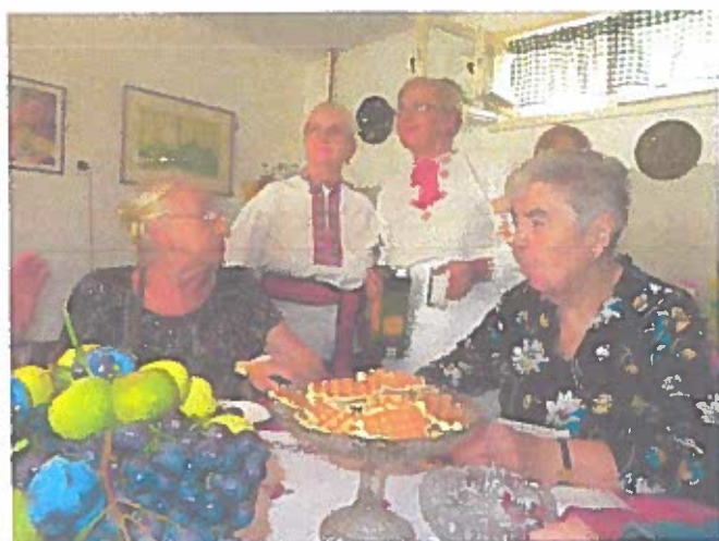
Two very experienced ladies testing and approving the 'ethnicity' of the snack provided by two delightful Ruthenian ladies.

Another 'fixed point' in the itinerary is the visit to the Milan Petrović School with a very busy programme and wonderful hospitality.