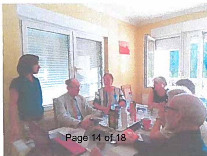
Page 14 of 18

During our visit we were taken to the school's facility for integrating Autistic young people into the community and teaching them skills for independent living at Sremska Kamenica. The young people and their mentors were off on an excursion so the group had the opportunity to see the excellent conditions provided and to receive a dissertation on the principles and practice of the initiative.