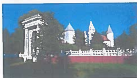
.....at Castle Fantast.

Our visits always seem to be a culinary adventure to which things are attached so it was no surprise that a visit to Bečej involving a city tour and visit to the river Tisa and the sluice control system, and a visit to the Castle Fantast and its bloodstock stud, surrounded a most wonderful venison lunch.