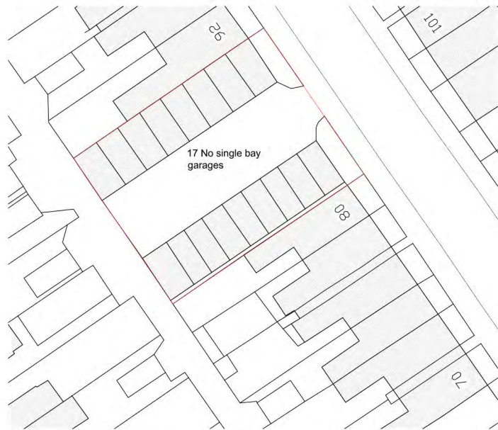
EXISTING SITE PLAN 1:200