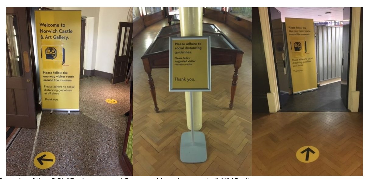
Sample of the COVID signage and floor markings in use at all NMS sites

Visitors and staff are expected to adhere to a 2 metre safe social distance at all times. To aid this, clear and distinctive COVID signage and floor markings have been installed throughout the museum to guide visitors through the one-way systems, as well as to the toilets and the exit.