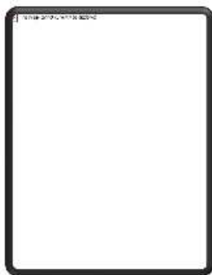
Figure 2: Proposed sign design