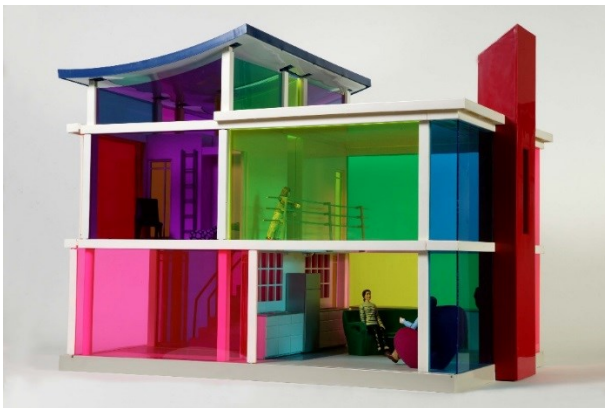
Kaleidoscope House Laurie Simmons, Peter Wheelwright and Bozart, USA, 2001

Selected as one of only two UK regional venues, NCM will host this international touring exhibition from the V&A Museum of Childhood. Showcasing a stunning collection of twelve of their best dolls' houses, this exhibition will attract families and doll's house enthusiasts from across Norfolk and beyond.