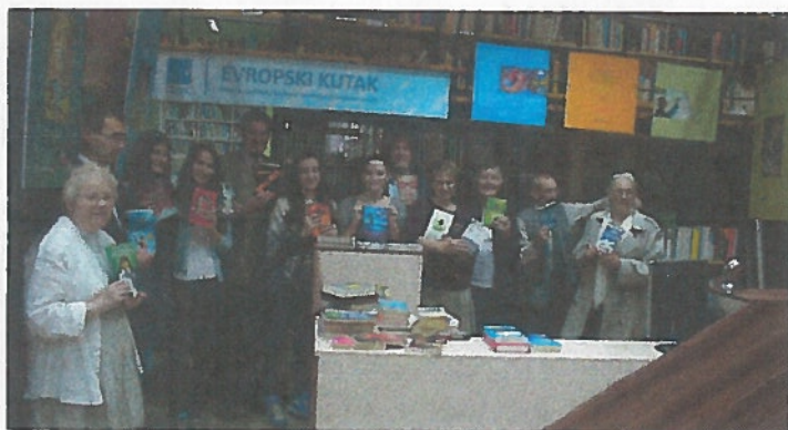
Happy donors and recipients