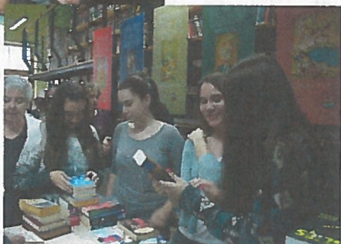
The young ladies who compiled the list were delighted with the books and - '....please can we have some more?'