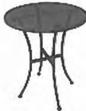
Round black steel Bolero table 600 mm