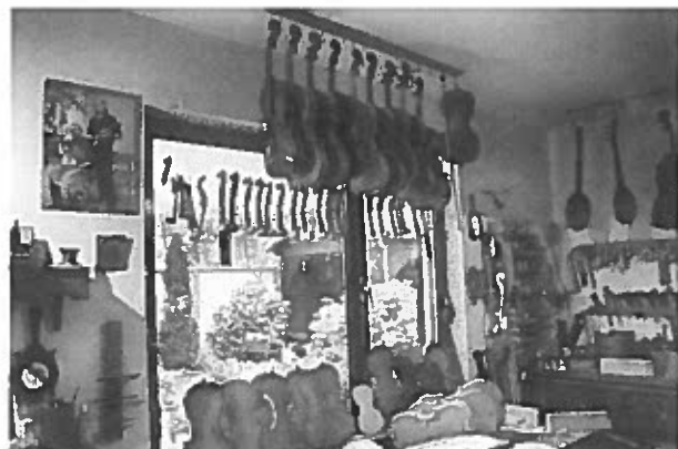
Violin maker's studio in Kovačica.

Some thirty or so talented young musicians from Norwich and Norfolk will be descending on Novi Sad in the latter part of July. A similar number will be arriving from Koblenz and its region of Germany. They will join forces with students of the Isidor Bajić school to rehearse and perform a challenging programme of classical music.