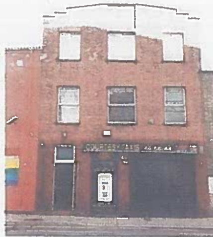
REAR ELEVATION from Rose Lane

Area for licensed activity – Late night refreshment