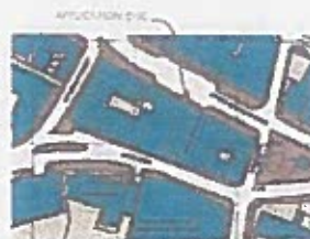
SITE LOCATION PLAN 1:250

sti architects 1 LANGBATH STREET EYE SP22 1AG Telephone: 01227 871231 www.stiarchitects.co.uk