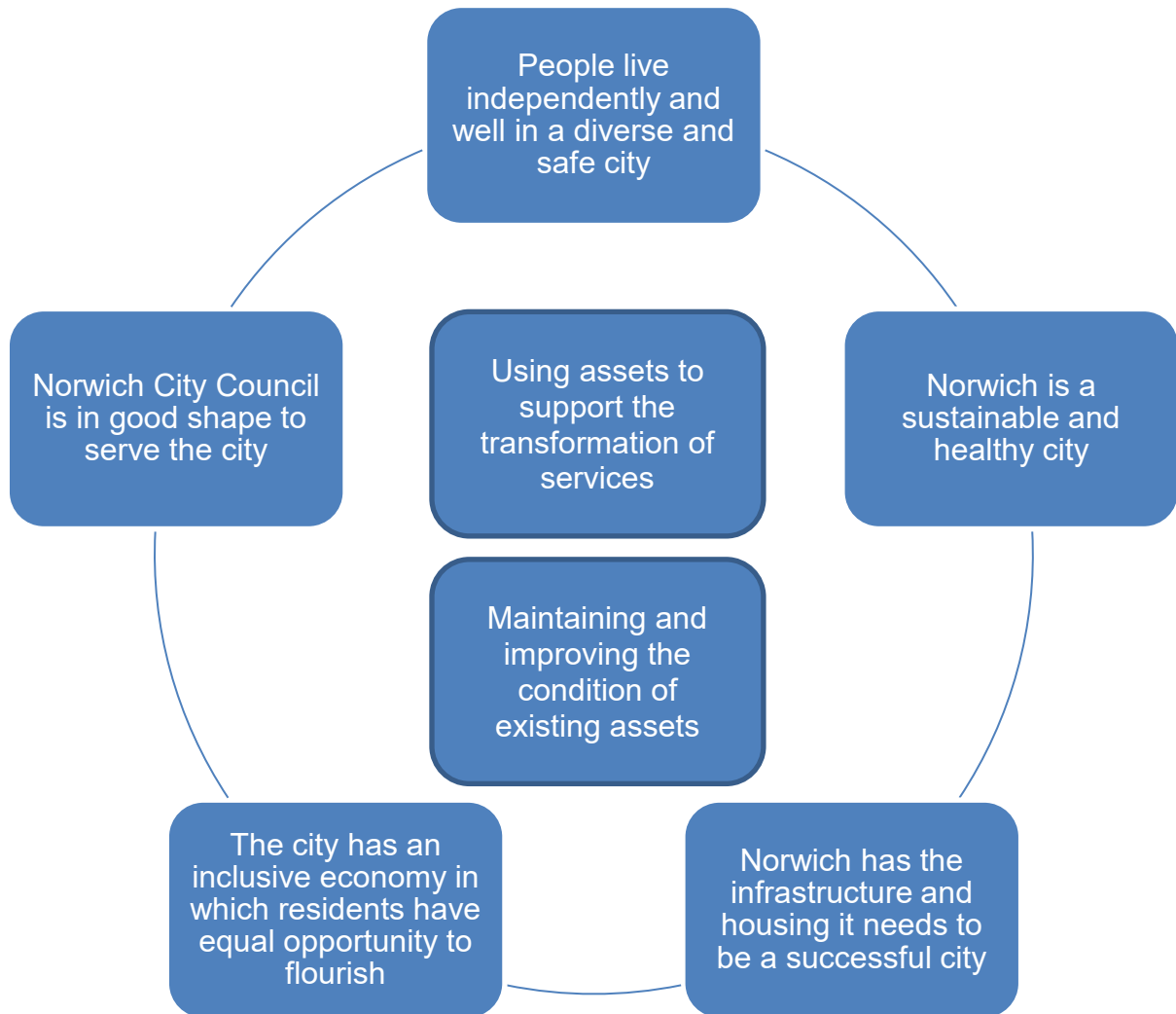
Chart 4.1: The proposed key drivers for capital investment