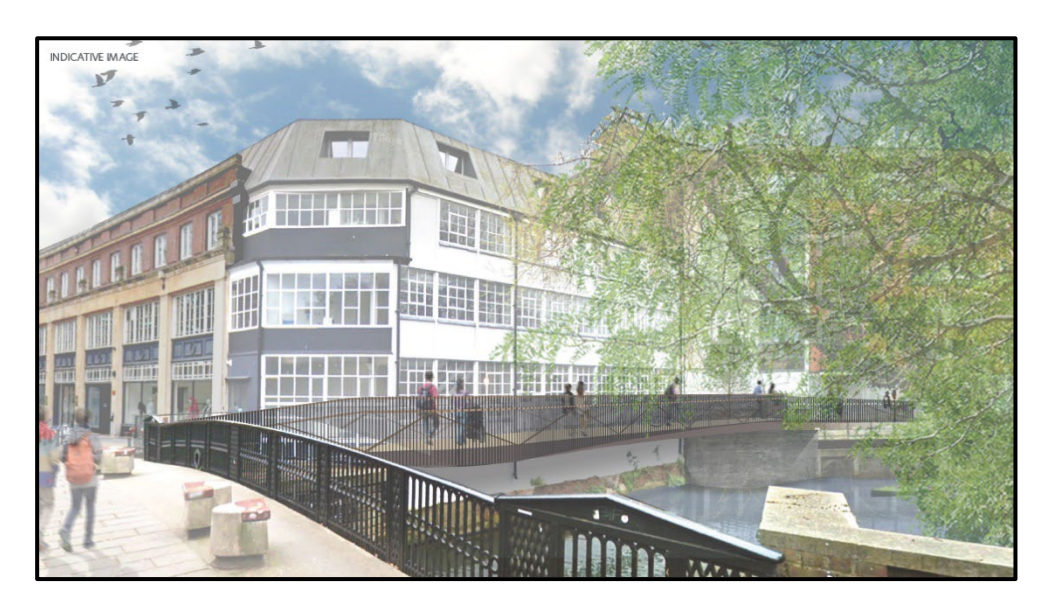
Figure 6: Indicative image of the proposed Missing Link project between Duke Street and St George's Street bridges.

2.9 A1 – Missing link in Riverside Walk: This project aims to complete a section of Riverside Walk between Duke's Palace and St George's Street Bridges, adjacent to NUA. Norfolk County Council have commissioned architects and structural engineers to scope out possible designs and costing. Initial consultation with some relevant bodies has been undertaken but further preapplication consultation is planned. Sustrans funding has been acquired and it is hoped that further CIL funding can also be obtained. The next stages of the project are to progress pre-application discussions, secure the remaining funding, and progress with more detailed designs and costing before making any formal applications and undertaking consultations.