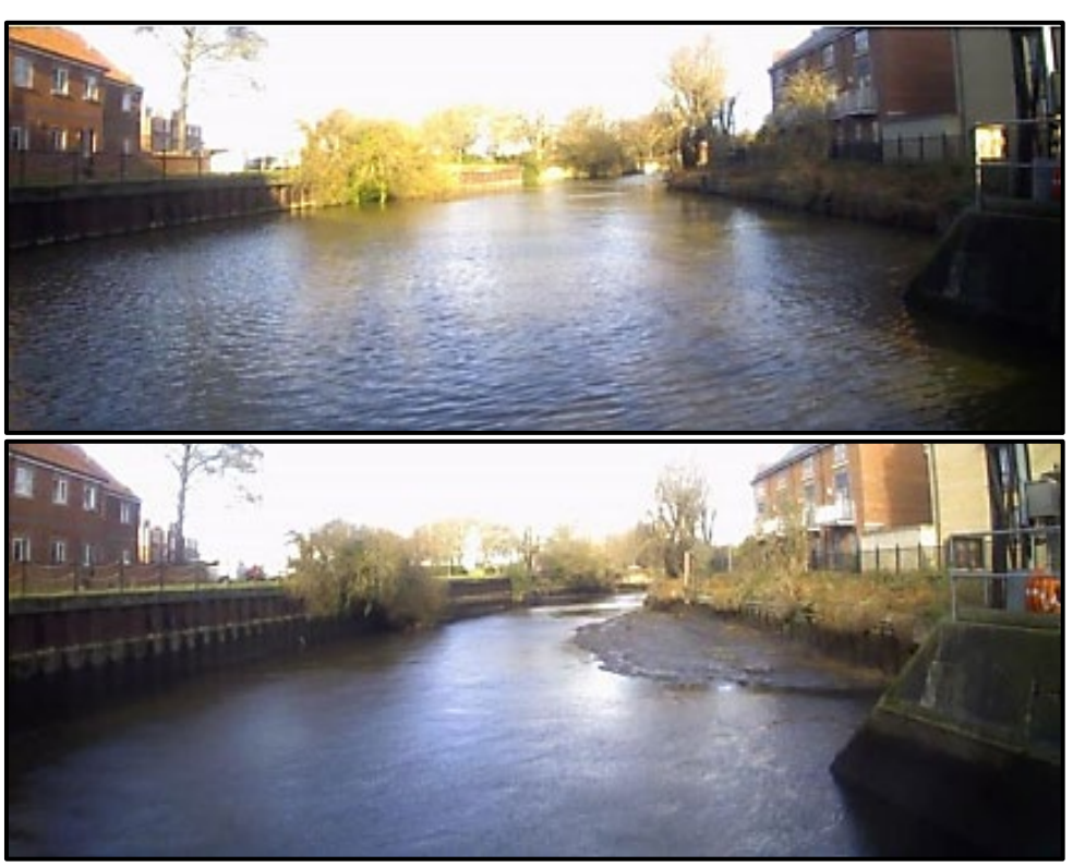
Figure 7: Photographs showing the effects of the New Mills draw down on water level before (top) and after with the exposed silt banks (bottom).

2.12 New Mills Draw Down: In February 2020, the Environment Agency undertook a trial at New Mills Pumping Station to see what effect the staged lowering of the water level at the Mill sluices has on the upstream reaches of the river. The trial was intended to investigate whether lowering the water level will have major ecological benefits and make the river function in a more natural state. The trial was important to understand the benefits and risks of making any changes to historic management. The trial resulted in a reduction in water level immediately upstream of 1.2m at New Mills, and 0.1m at Hellesdon Mill. This left silt banks evident either side of the narrower channel.