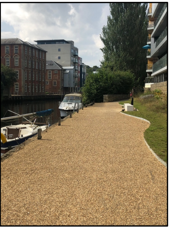
Figure 5: Moorings installed as part of the NR1 housing development opposite Carrow Works.

2.8 W8 - Hydrographic survey for dredging : This project was complete in 2017 with Broads Authority funding. The survey was required to assess current dredging requirements and to inform future dredging operations. The data collected from the hydrographic survey is entered into a model to assess the waterways compliance score, which compares the desired riverbed profile to the measured profile. The data from this survey showed that the Wensum scored highly and therefore was not the highest priority for dredging. A river section up to Trowse bridge was however dredged in 2020.