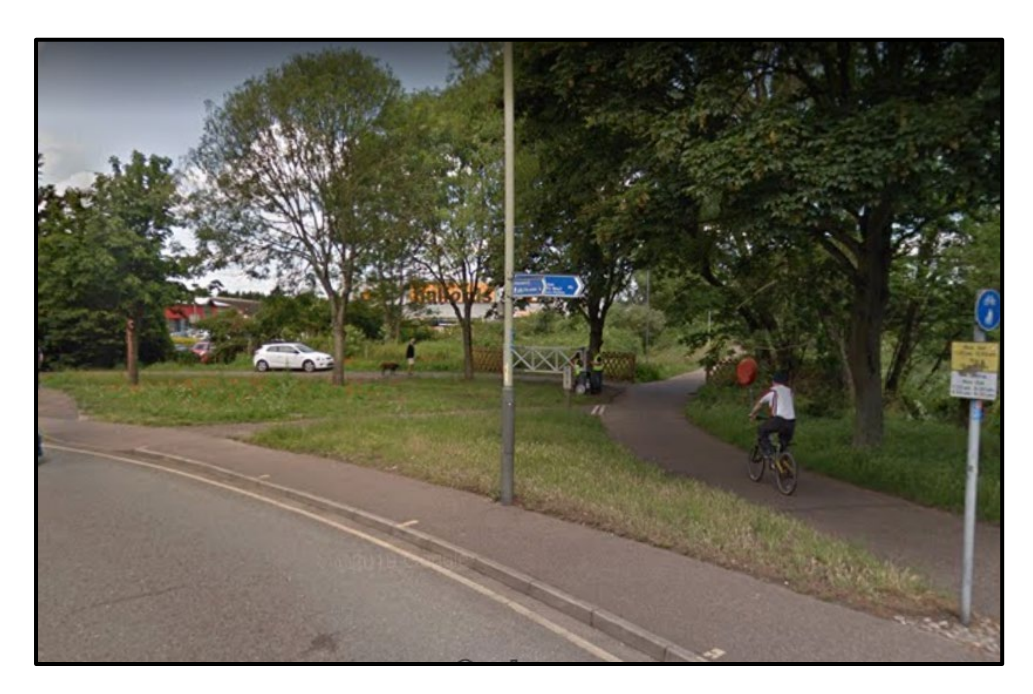
Figure 1: The completed project A3 Barn Road Gateway improvements.

2.3 A3 – Marriott's Way/Barn Road Gateway: This was completed in March 2019 using CIL and Heritage Lottery funding. Norwich City Council lead on this project and the works undertaken by Norfolk County Council and Tarmac. The project proposed improving access to the Marriott's Way route by improving legibility from the Barn Road roundabout entrance. This involved removing overgrown vegetation, upgrading fencing and improving the public realm space surrounding the entrance to encourage increased use of the route.