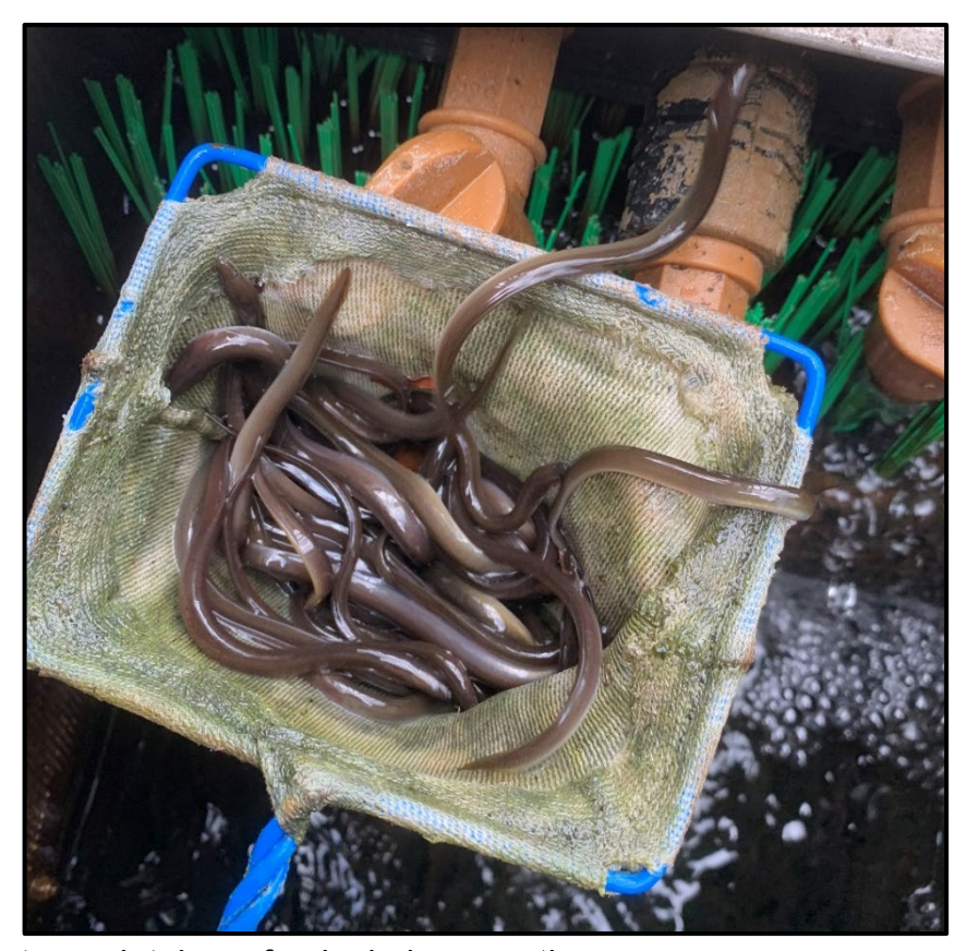
Figure 4: Photograph taken of eels during counting.