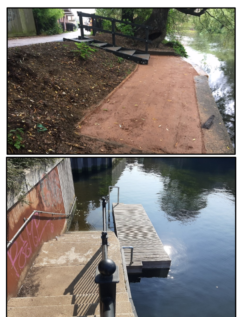
Figure 2: The completed canoe portages upstream (top) and downstream (bottom) of New Mills.

installation. The alterations to the installation have now been completed in full. Rangers will monitor the usage of the platforms but early indications are positive.