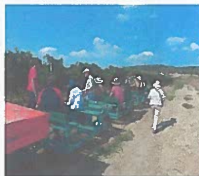
As does visiting local vineyards to test the wine.

There was an opportunity to visit the village of Indjia for a member to find his ancestral home. This was a successful mission. (Although the ancestral home seemed to have developed into a night club of dubious repute!).