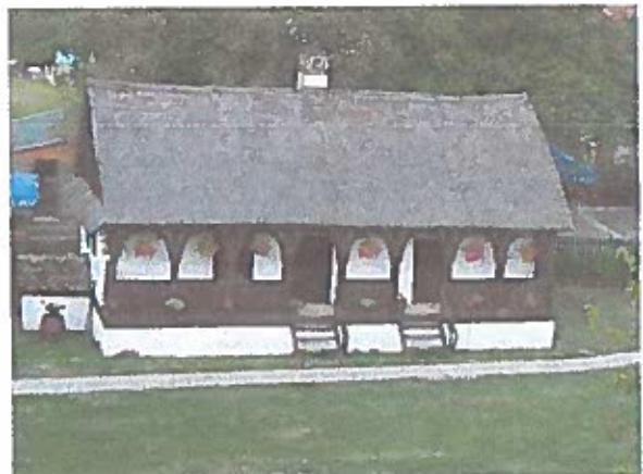
More holiday snaps at Obedska bara nature reserve