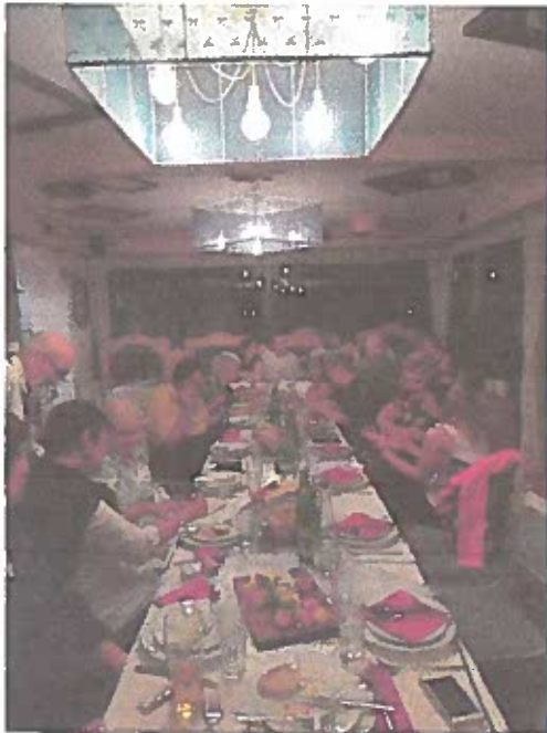
Dining with friends

The visit to Novi Sad is always celebrated with an evening meal on the last day to which friends in the city are invited. This year, with so much going on it was with regret that several of our close friends were missed out which is much to be regretted. However, next year we will be much more organised.