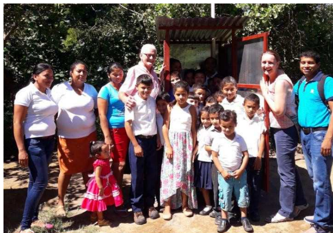
The Dutch Group, teachers and pupils, at the completion of the new latrine at the El Recreo School

An approach to the Nicaraguan Embassy in London for information about where responsibility for providing and maintaining school latrines failed to elicit any information about the problem.