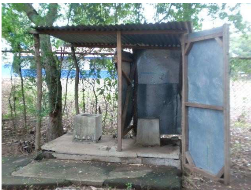
Dilapidated state of latrines at Rosario Mayorga School (See report Para 3)

Submitted to the Annual General Meeting 28 th February 2017