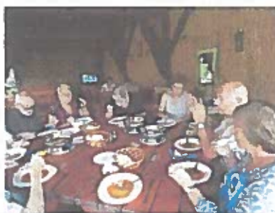
Enjoying local food always seems to feature large in the itinerary of the visit.

New members to this 'holiday experience' found their days full and, sometimes, a little frantic. There was, however, plenty of time in the programme to meet old friends and make new ones.