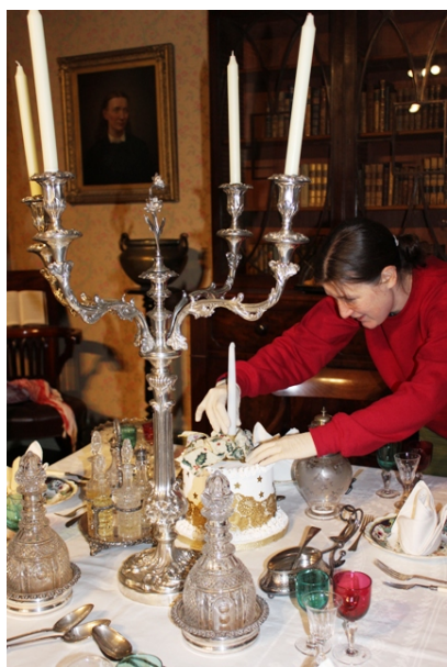
Staff preparing Strangers' Hall for the Christmas event

As usual Father Christmas flew in to preside over his toy workshop, parking his sleigh in our coach house, and learning team staff showed museum collections on the theme of 'Winter Warmers'.