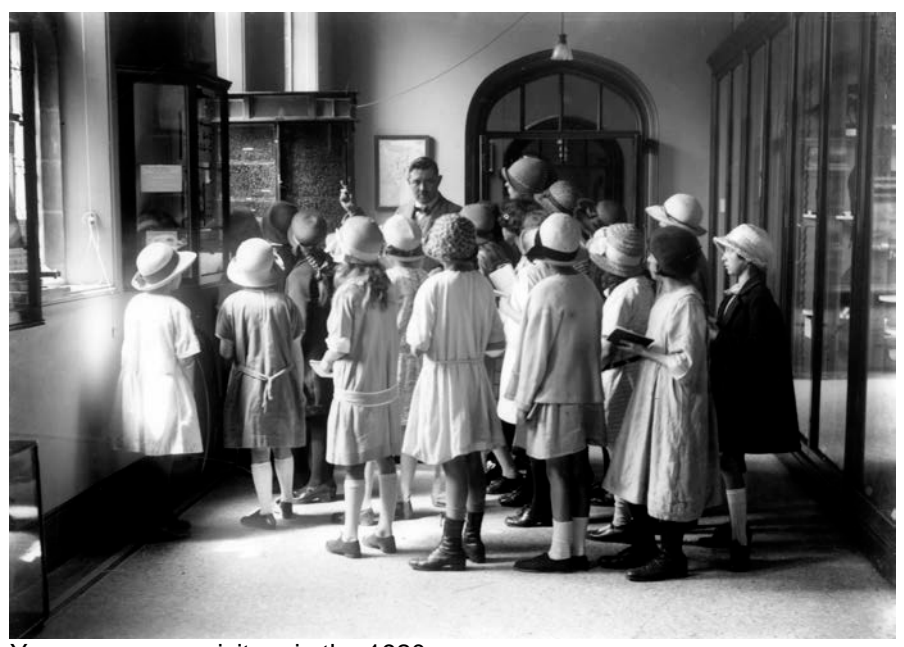
Young museum visitors in the 1920s

It was a successful event, with over 670 visitors, and the addition of members of The Royal Norfolk Regiment Living History Group, who added to the atmosphere. Visitors had the chance to take the journey from recruitment, to medical, to basic training, and could also take part in a drill. Children were encouraged to write postcards to soldiers serving at the front, which were displayed in the rotunda. The children from the Saturday morning Museum Club showed a particular interest and seemed to really enjoy the mix of activities.