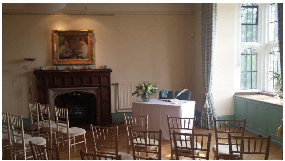
The Benefactors Room set out for a Registrars Service wedding ceremony