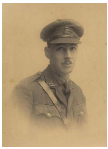
Lieutenant Cecil Upcher

The second exhibition element is the result of a community-based project run by Norwich HEART. Volunteers with HEART researched the lives of Colman's workers during the First World War, and the response the company had to the War, and the impact it had on the lives of its employees. The 'Colman's Detectives' used NMS archives, as well as getting access to the Unilever archive collection to put the exhibition together. Originally on display at the Forum, it will be on display at the Museum of Norwich until 5 March.