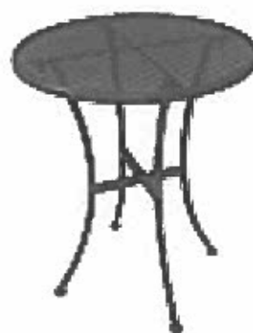
Round black steel Bolero table 600 mm