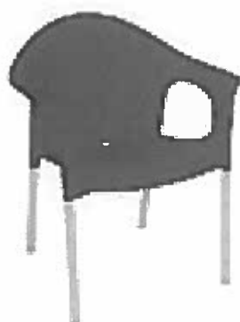
Black Bolero stacking armchair aluminium/plastic