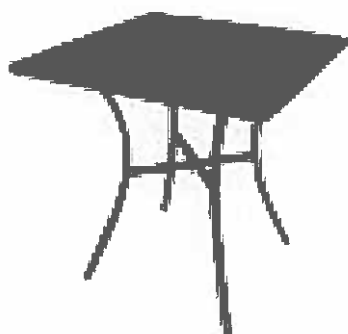
Square black steel Bolero table 700 mm