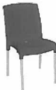
Black Bolero stacking side chair aluminium/plastic