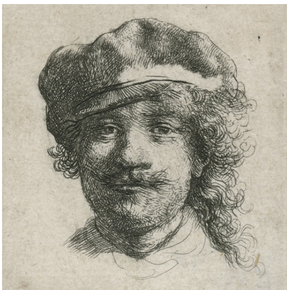
Rembrandt van Rijn, Self-portrait c 1634. Etching, ©Norwich Castle Museum

This major exhibition at Norwich Castle showcased the extraordinary NMS collection of 93 prints and one drawing by Rembrandt, alongside national loans from the British Museum, National Galleries of Scotland, National Gallery and the Royal Collection. Rembrandt's preoccupation with light and shade is seen throughout his work and this exhibition revealed how Rembrandt created unsurpassed effects of light and darkness. The exhibition saw strong attendances throughout its run. An illustrated catalogue was produced to accompany this important show, with good sales of some 900 copies.