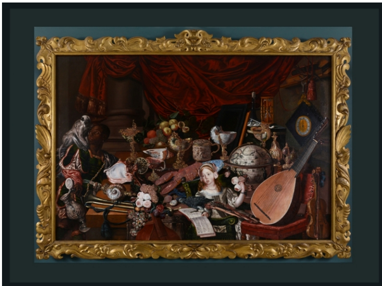
Anonymous, Dutch School, The Paston Treasure c.1665

This major exhibition in collaboration with the Yale Center for British Art will gather together some of the extraordinary treasures depicted in the mysterious Paston Treasure painting for the first time in three centuries, featuring a number of very significant national and international loans. The first leg of this exhibition has recently opened at the Yale Center for British Art, Connecticut – for more information please see https://britishart.yale.edu/exhibitions/paston-treasure-microcosm-known-world