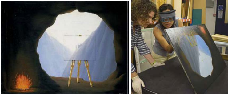
La Condition Humaine by Rene Magritte

The current extended exhibition in the Colman Project Space is Magritte: The Lost Painting . This explores the story of the detective work recently undertaken on NMS' Magritte painting La Condition Humaine , where a quarter of a missing Magritte painting, La Pose Enchantée was discovered underneath the later work.