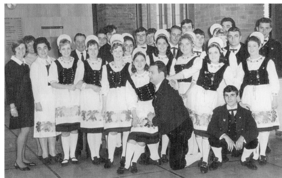
First visit 1968 - 2018 50th Anniversary to Norfolk