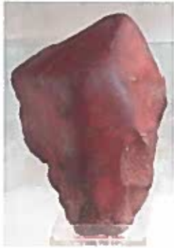
„Winninger Faustkeil“ 700.000 v. Chr.