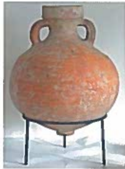
Winninger Weinbau, seit der Römerzeit