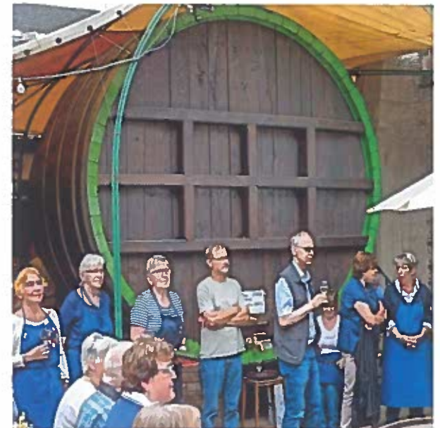
„Winninger Fass“, 30780 Ltr.