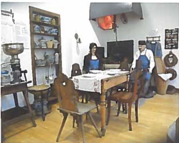
Bürgerliches und Bäuerliches Wohnen

Erste Erwähnung von „Windinge“ im Jahre 871