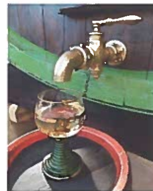
Weinprobe ab 15 Pers.