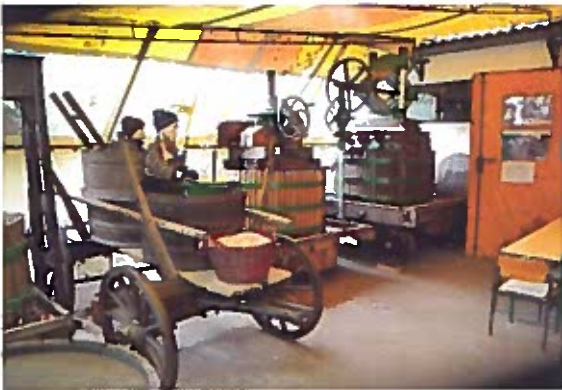
Weinpressen aus 3 Jahrhunderten